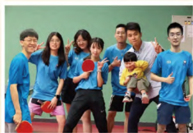
TABLE TENNIS TEAM 乒乓球隊