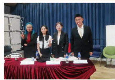
DEBATE TEAM 辯論隊