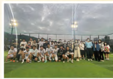
FOOTBALL TEAM 足球隊