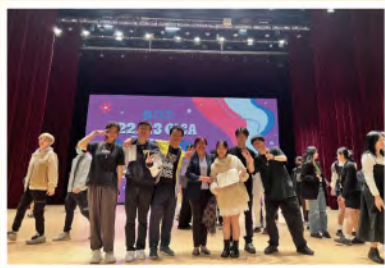
COLLEGE BAND 書院樂隊