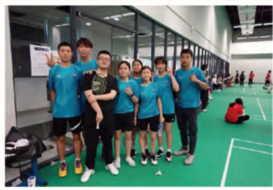
BADMINTON TEAM 羽毛球隊