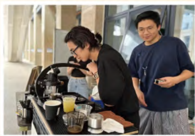
COFFEE CLUB 咖啡社