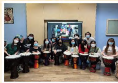
AFRICAN DRUM TEAM 非洲鼓隊