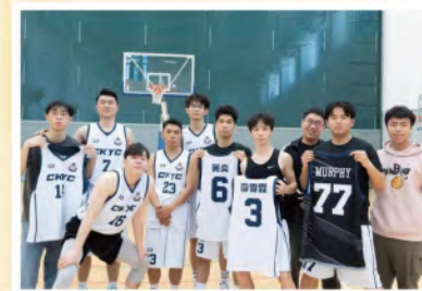
BASKETBALL TEAM 籃球隊