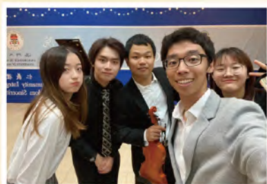
MUSIC GROUP 音樂小組