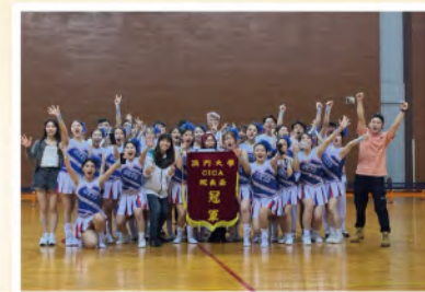
CHEERLEADING TEAM 啦啦隊