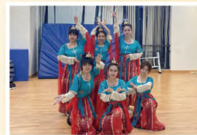
DANCE TEAM 舞蹈隊